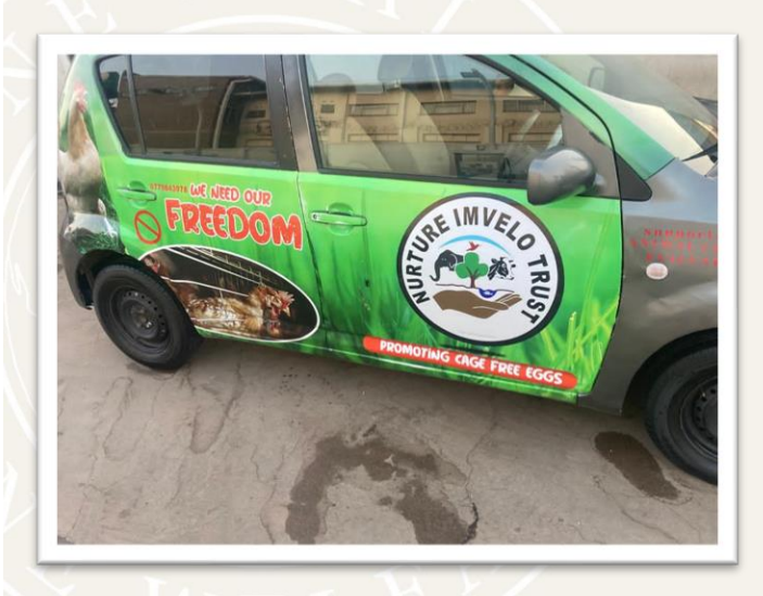
Sanele and her team make farm visits and express their appreciation to cage-free farmers by advertising their eggs on the Nurture Imvelo Trust's online platform.

"We engage farmers who are still using cages and make them aware that battery cages are one of the cruellest inventions of factory farming.